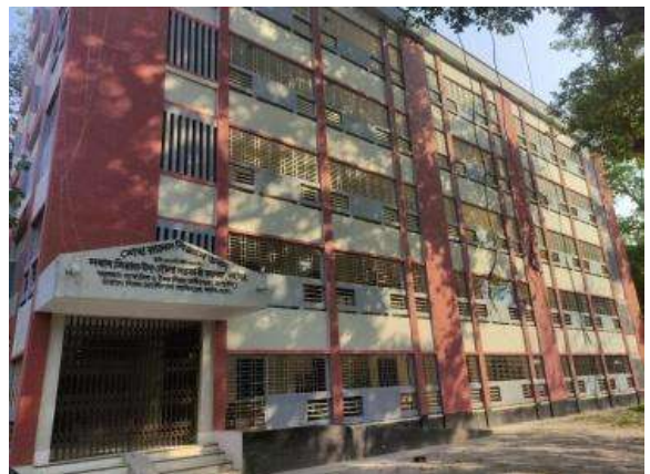
Sheikh Rashel Science Bhaban