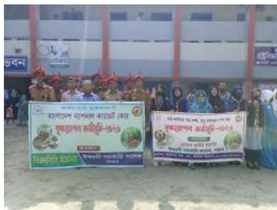
Tree plantation program