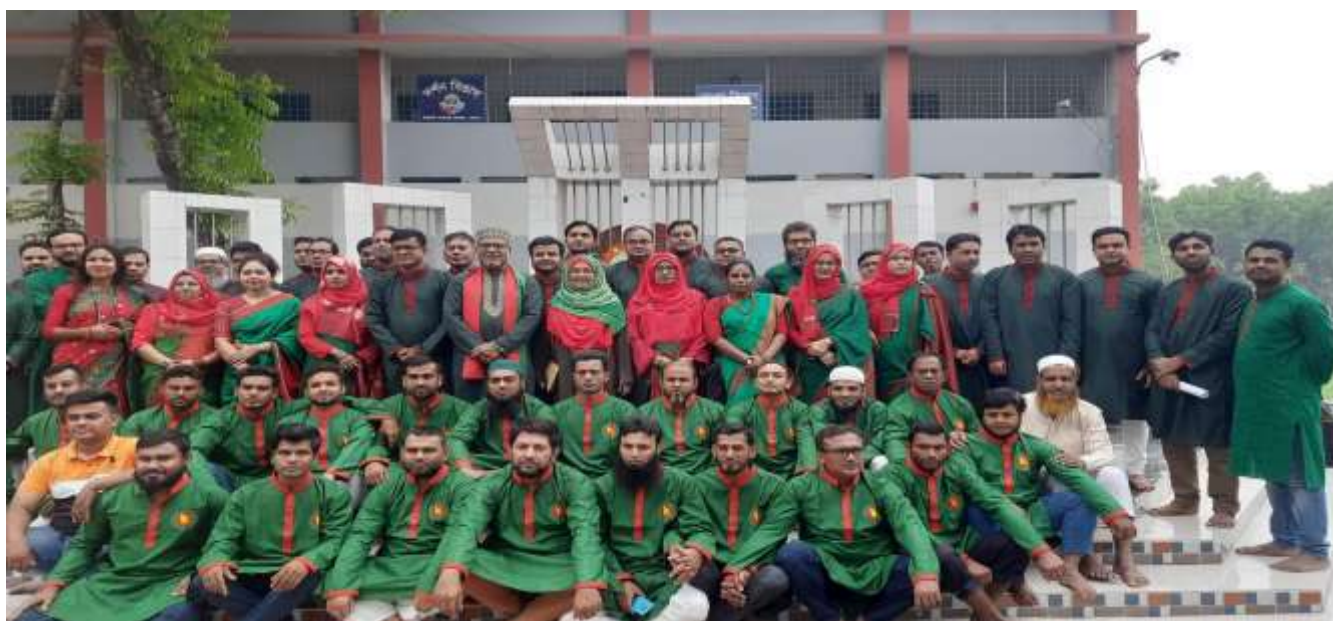
Teachers and staffs of college in 26 th march

During the year 2023, all departments of Ishwardi Govt. College have actively worked towards recovering from the losses caused by the COVID-19 pandemic. Following the aftermath of the pandemic, each department has provided additional time for students to catch up on their studies. Additionally, cultural and sports programs have been organized frequently to promote the physical and mental development of the students. The 12 departments offering Bachelor of Honors degrees have enriched their libraries with academic and supplementary books. The participation of each department in national events has been spontaneous. Throughout the year, a total of 7 seminars and workshops have been organized by 5 different departments. Thanks to the collective efforts of teachers, students, and other staff members, the academic environment has become healthy, leading to an acceleration in academic results.