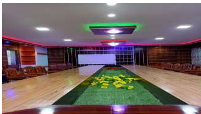
Interior Decoration of staff council's Room