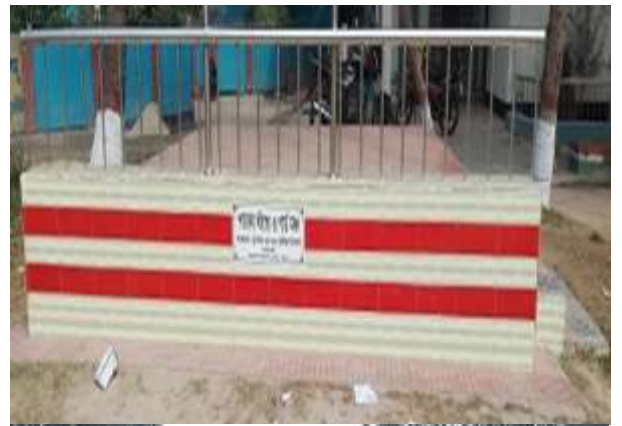
Flag stand and guard stage