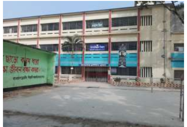
Business administration Building