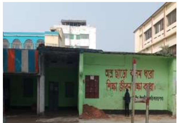
old unused Building