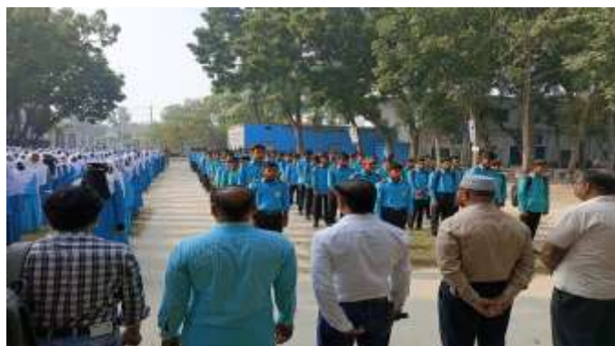
Assembly before class