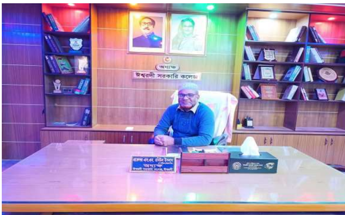
Interior Decoration of Principal's Room