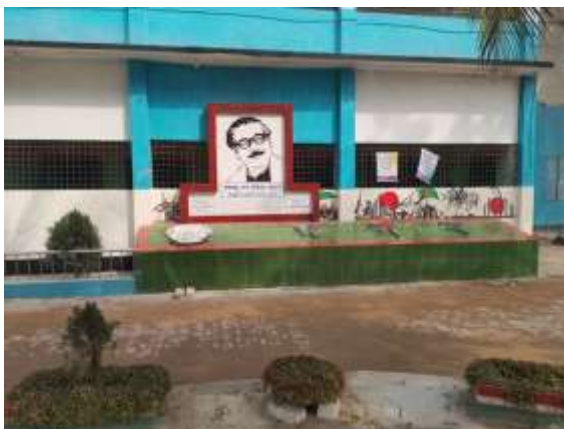
Mural of father of nation