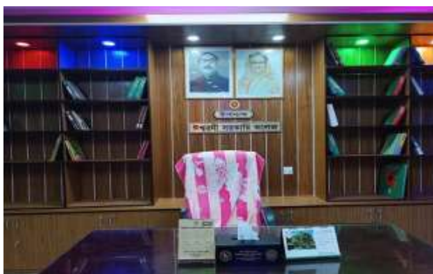
Interior Decoration of Vice Principal's Room