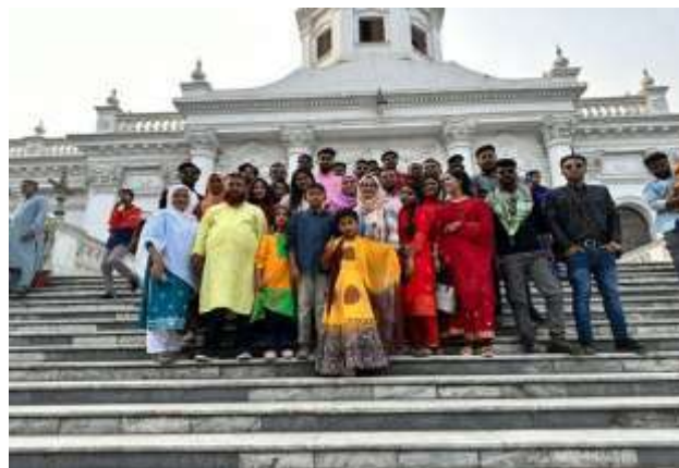
Annual Study Tour of political Science