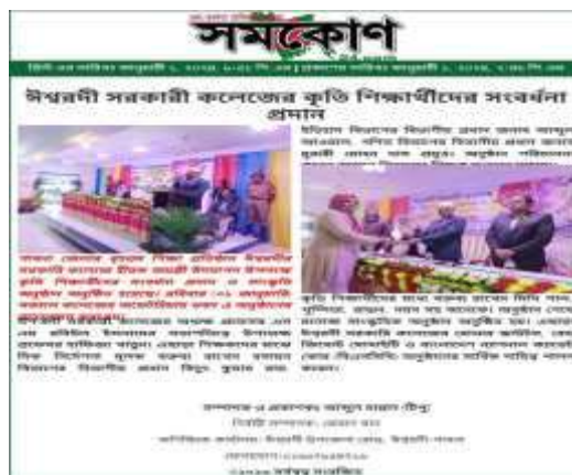
program to appreciate talented students