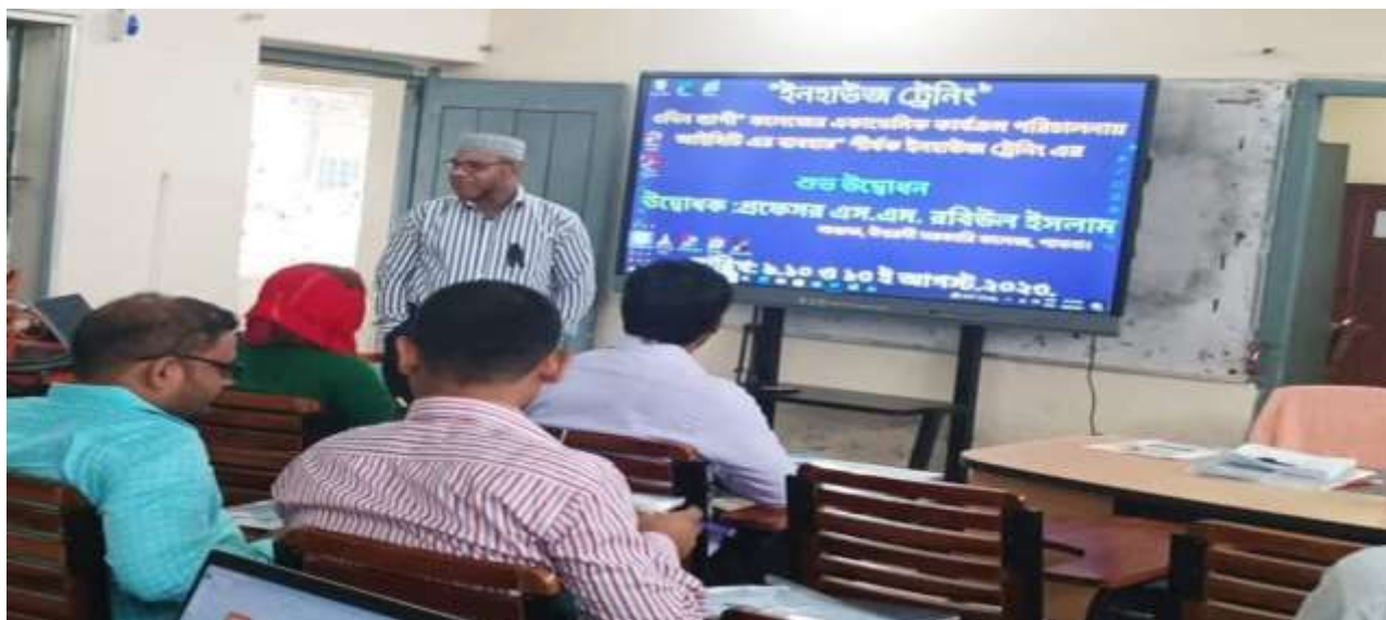
In-house Training about usage of ICT in academic and administrative activity