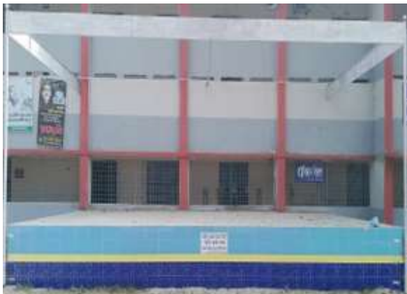
Shaheed maruf hasan mintu mukto mancho