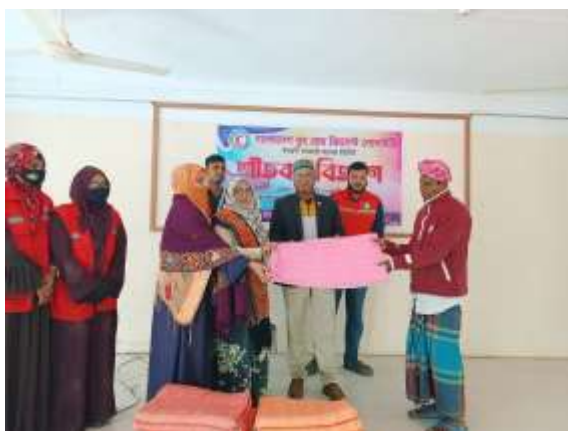
Supporting Aid to combat cold weather