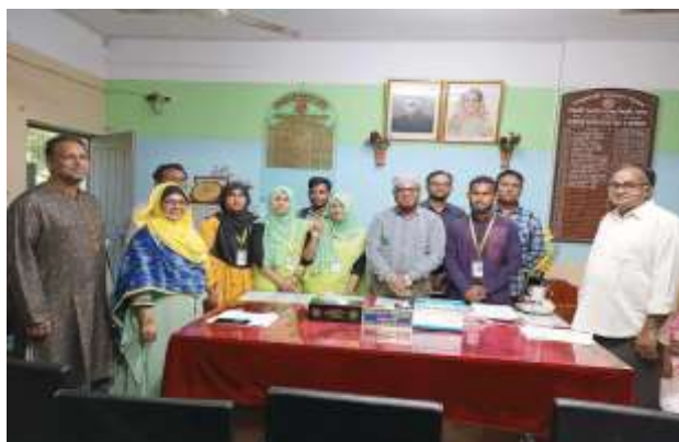
Debate champion team: Chemistry